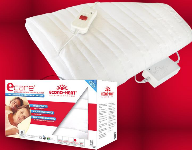
MODELS: EB91S, EB137S, EB137D, EB152D, EB183D

ecare ® EXTRA LOW VOLTAGE ELECTRIC BLANKET THE ULTIMATE IN HEALTH AND SAFETY