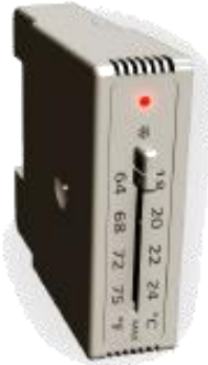
Thermostat Module Model 104