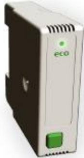
Eco Module Model 103