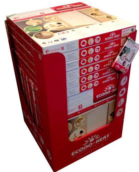
16 Unit – Store Stacker