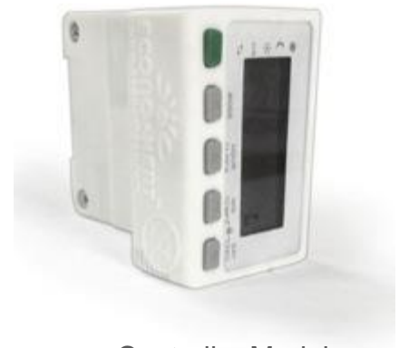
eController Module Model 102