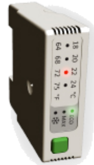
Eco-Thermostat Module Model 105